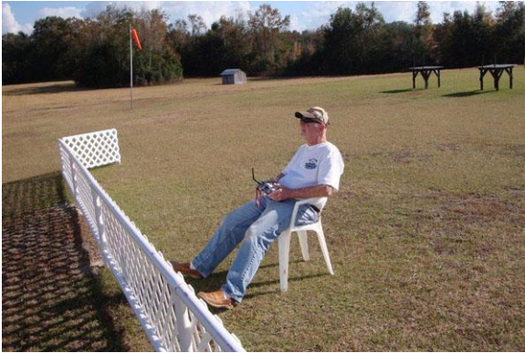
It doesn't get much better than this!! Where is the cup holder on this chair?