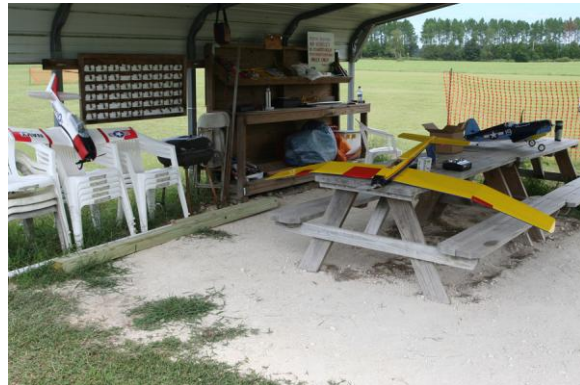
Looking for shade on a really hot day!