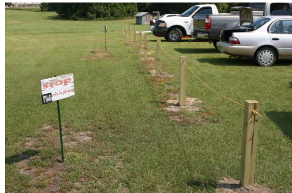
Parking lot divider

We still have to put up the rope parking lot divider on the west side of the shelter and remove the old dilapidated plastic fence. Dan Beard has donated some field fencing to replace the plastic fence in front of the shelter. When there's time we'll be putting that up too.